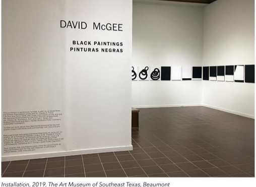
Installation, 2019, The Art Museum of Southeast Texas, Beaumont

In 2017, I began a series of paintings titled 'Urban Dread' which has since become ongoing. The paintings themselves measure 24 x 18", are all oil and mixed medium on burlap, and they use only black and white; no figures exist.