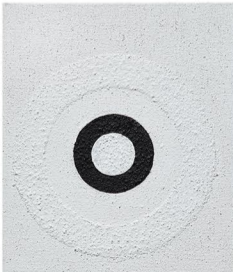
Target (Double White)