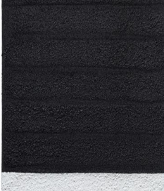
Good Fences (Black)