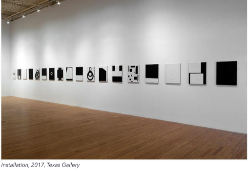
Installation, 2017, Texas Gallery

When asked, "How can the simplicity of the paintings convey such emotions?", I respond by saying our perceived ideas of our own humanity and the warping of all the visuals we take in internally can often be reduced to flattened and vacuumed emotional space; such feelings do affect us externally. In that regard, social distancing has been with us for quite some time. I want the paintings to reflect that intensity of space, to purge dark from light and vice versa. I also wanted to express the real fear of African Americans in urban cities in that we didn't need a pandemic to already feel the health disparities and the economic woes that press upon us.