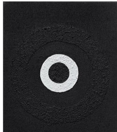
Target (Double Black)