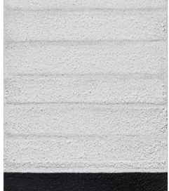
Good Fences (White)