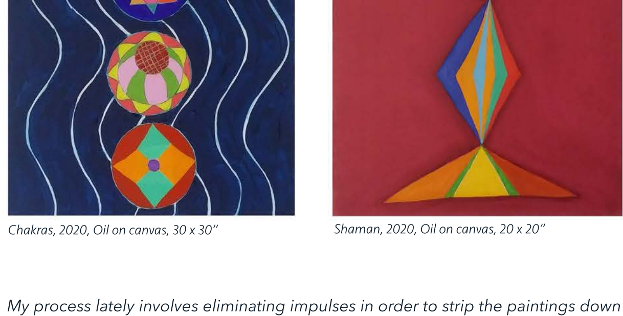
to more essential elements. I think this is due to increasing confidence that comes as